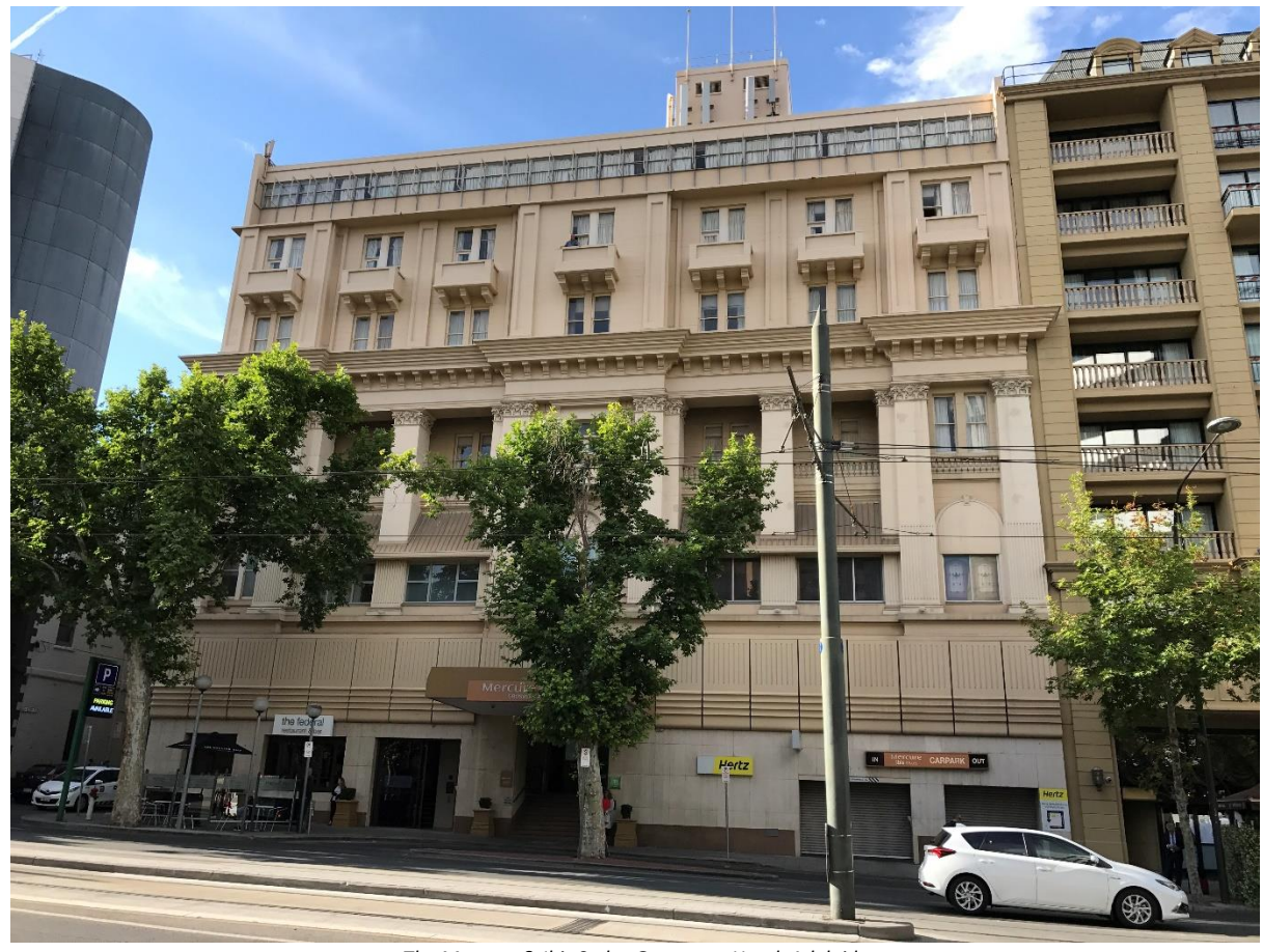
The Mercure & Ibis Styles Grosvenor Hotel, Adelaide

29 November, 2017 – Chip Eng Seng Corporation Ltd (CES) is pleased to announce that it has contracted to acquire the Mercure & Ibis Styles Grosvenor Hotel in Adelaide, Australia for AUD43 million.